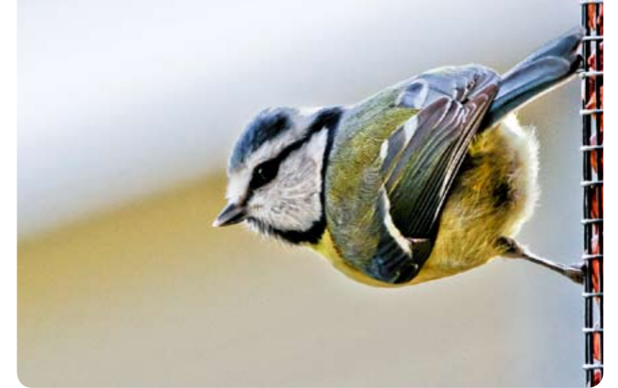
Top: blue tit Above: comma

There is also an increasing demand and desire for locally grown food. London's gardens could contribute to meeting this demand (as they have done in the past) but only if the quantity and quality of the resource, particularly a healthy garden soil, is maintained.