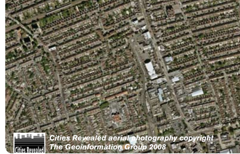
Cities Revealed aerial photography copyright The Geoinformation Group 2008