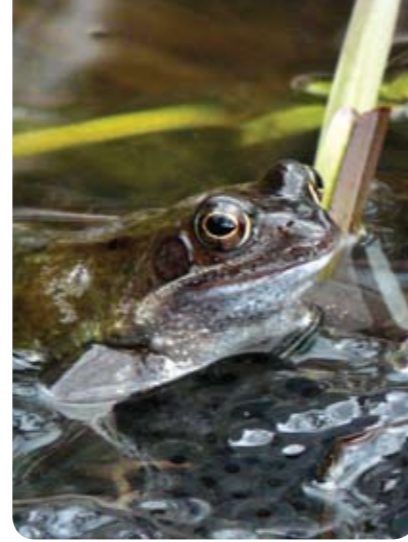
Right: common frog