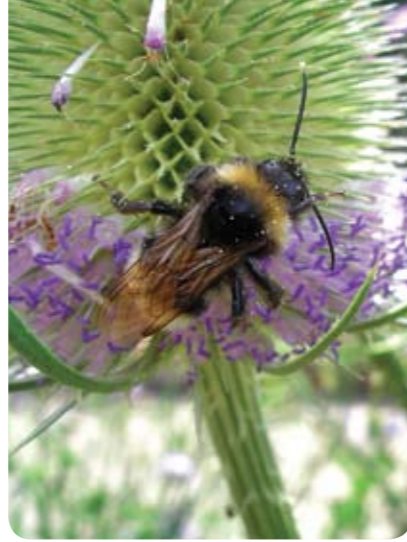
Centre: bumblebee on teasel © Metalanguage Design