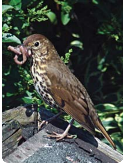
Left: song thrush