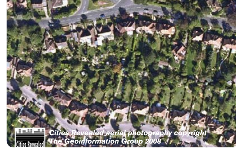
Cities Revealed aerial photography copyright The Geoinformation Group 2008