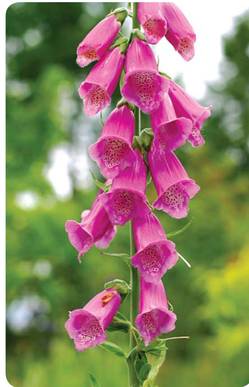
Above: foxglove