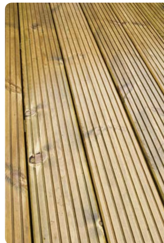
Top: a highly designed garden Left: decking Right: front gardens lost to parking

An area of vegetated garden land equivalent to 21 times the size of Hyde Park was lost between 1998-99 and 2006-08, representing 3,000ha or a 12% reduction. This constitutes an annual loss of an area two and a half times the size of Hyde Park.