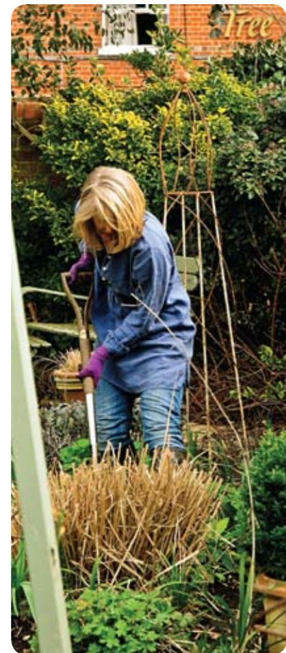
Above: gardening

For further information on wildlife gardening across the UK go to The Wildlife Trusts and the RHS' gardening website www.wildaboutgardens.org.uk